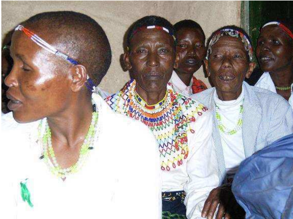
Iraqw women, Kwermuhi, Tanzania, January 2005.

Leiden University Centre of Linguistics Februari 2007